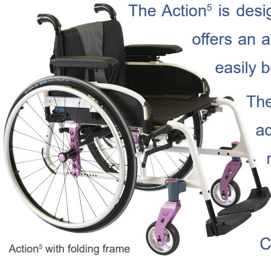
Action 5 with folding frame

The Action 5 is designed specifically for users with an active lifestyle. It offers an affordable chair with good drive performance that can easily be folded for handling, storage or transportation.