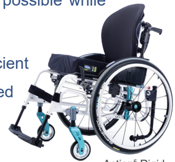
Action 5 Rigid

The Rigid frame option makes for an even more robust, energy efficient lightweight wheelchair. Highly configurable, it offers the choice of fixed or swing away front frame for easier transfers or transportation.