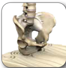
Ischial tuberosities protected by round "Owl" design

It is designed predominantly for use in a wheelchair, housing the ischial tuberosities within it's circular surface in areas where skin is normally vulnerable to breakdown. The design also takes into consideration pelvic tilt aspects amongst other key areas and provides the ultimate combination of pressure care and patient comfort.