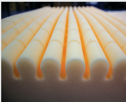
Cross-section of castellations (tear duct cut)

comfort and product longevity. The Mercury is completed with a durable multi-stretch, vapour permeable cover and a toughened polyurethane base. It provides an important contribution towards tissue viability standards of modern hospital, nursing or homecare environments.