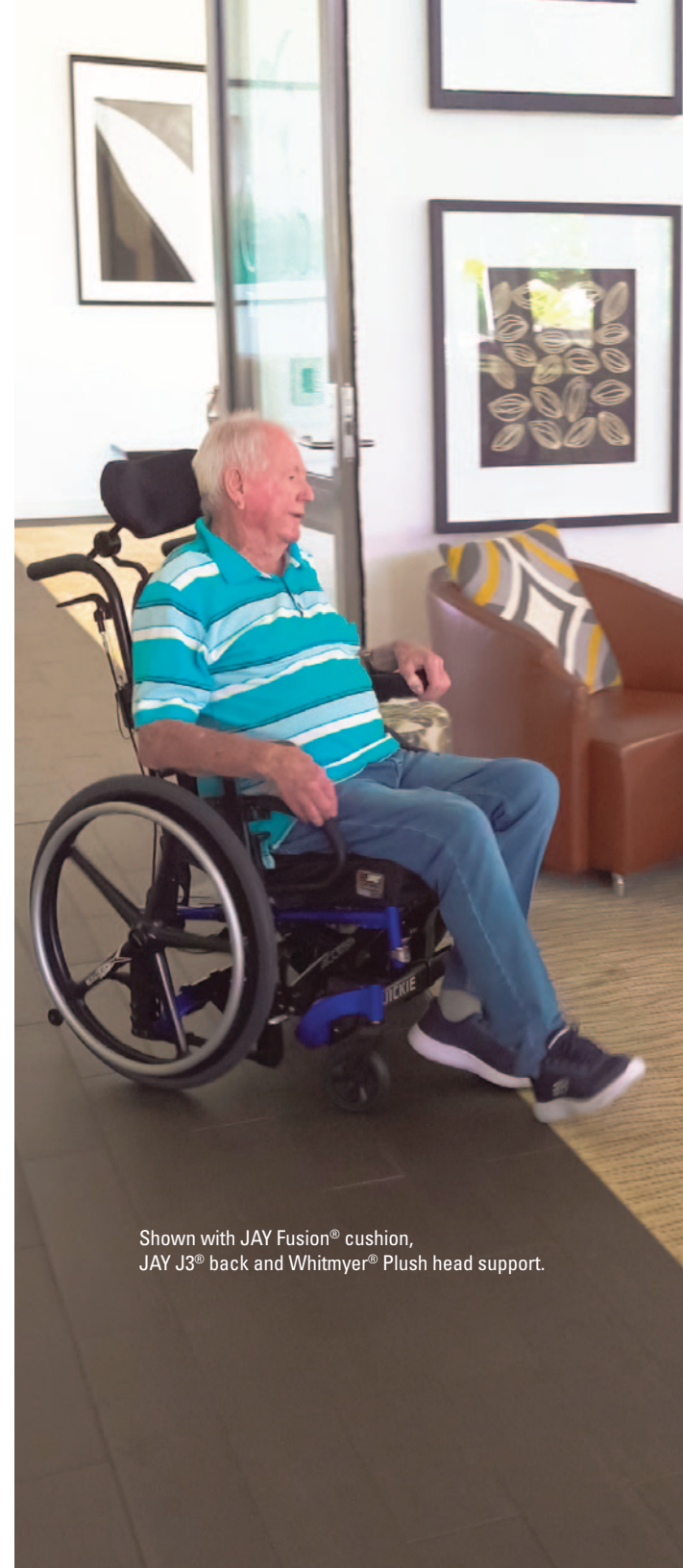
Shown with JAY Fusion® cushion, JAY J3® back and Whitmyer® Plush head support.