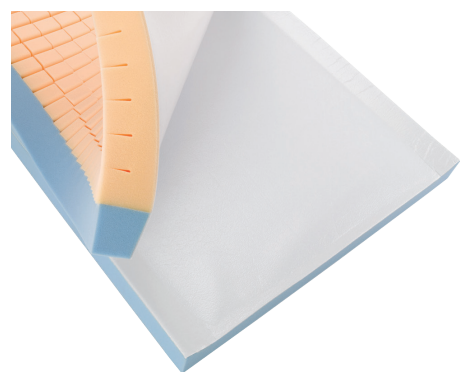
Patented Glide system allows mattress to fully conform to bed frame