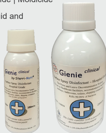
Available in 100ml & 250ml