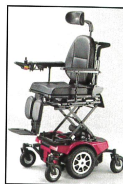
Seat elevator travel range: 30cm/12inch