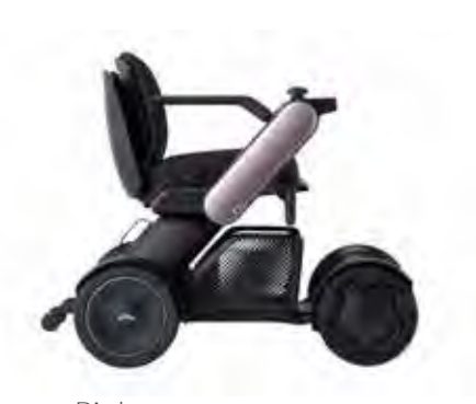
Pink LEFT / WCA870560 | RIGHT / WCA870570