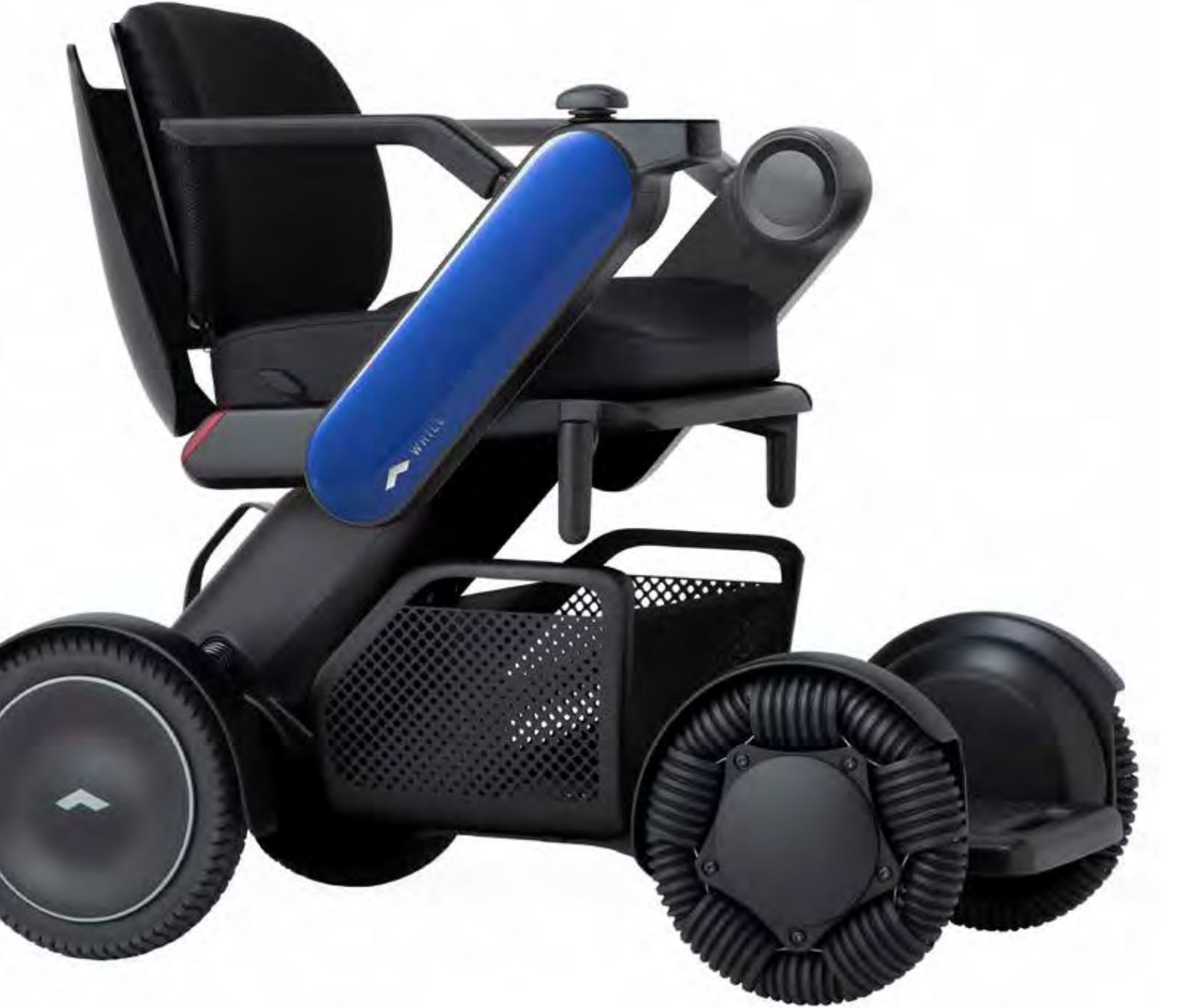
Navy Blue LEFT / WCA870540 | RIGHT / WCA870550