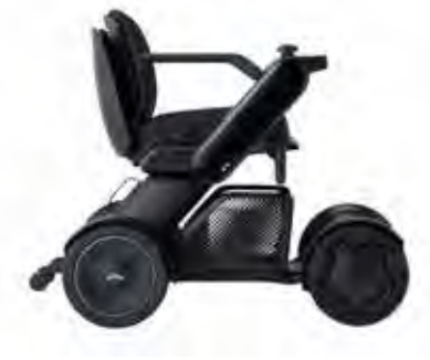
Black (supplied standard) LEFT / WCA870460 | RIGHT / WCA870470