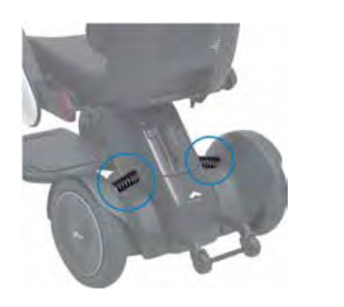
Rear wheel suspension absorbs the impact when driving over bumpy roads or obstacles.