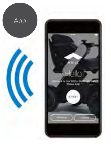
Check your total mileage, distance travelled, battery level, full charge cycles and more with the WHILL app*. You can also lock and unlock the unit.

*You will need to install the application beforehand.