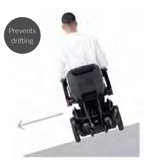
Drive straight on a tilted path.