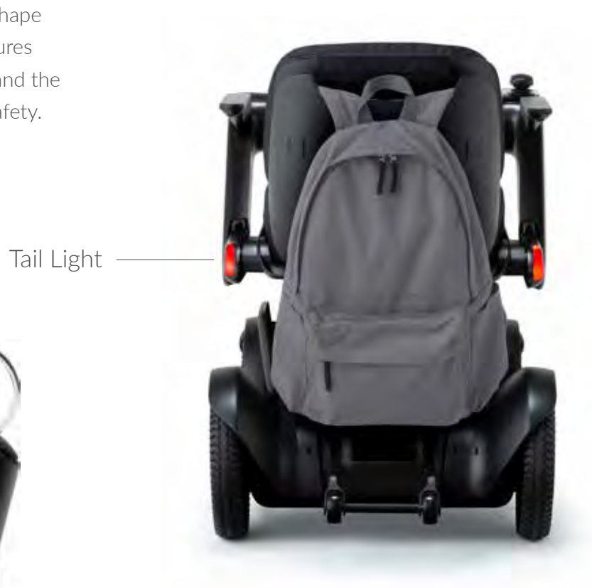
The tail light is clearly visible even with a bag hung over the back support, keeping you safe on the road at night.

Feedback from our customers has helped shape the Model C2. We've packed in all the features you're looking for, including a remote lock and the ability to adjust the max speed for added safety.