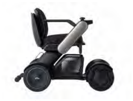
Gold LEFT / WCA870480 | RIGHT / WCA870490