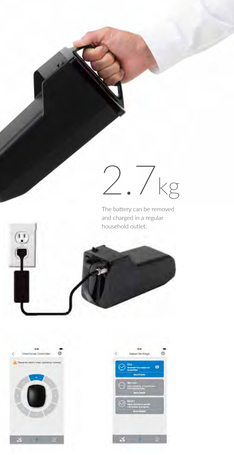
The intuitive controller screen allows you to control the unit remotely.

*You will need to install the application beforehand.