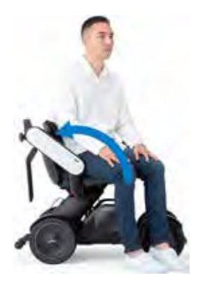
Adventure with WHILL - the Model C2 can make tight turns, allowing you to go places that a typical scooter can't take you.

Lift the arm to easily sit down in the chair from the side. Stand on the foot support for added stability.