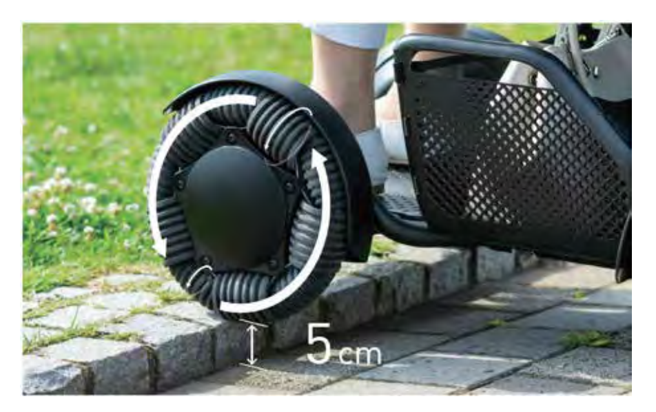
Effortlessly climb over obstacles up to 5cm in height with two powerful motors and large front omni-wheels.