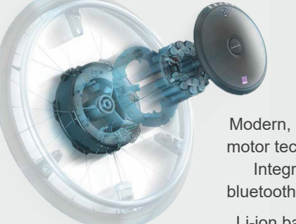
Modern, efficient motor technology Integrated bluetooth module Li-ion batteries

Easily compatible with existing wheelchair Suitable for users with limited arm & body strength Three wheel sizes - 22", 24", 26" Electronics and battery integrated in wheel hub Magnetic contact charging plug - charge both e-motion wheels at the same time Optional ECS remote control Brushed stainless steel push rim Smartphone connectivity to access additional functions and possibilities