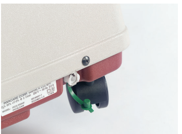
HomeFill connection port.