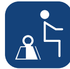
Max. User Weight ▼