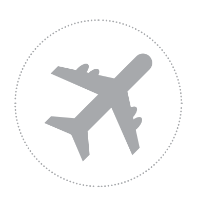
▲ FAA Compliant

A bright, backlit, LCD screen delivers relevant information to patients and, together with the battery indicator, allows them to be confident as to the status of their oxygen supply.