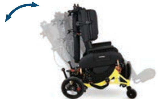
Adjustable seat tilt makes for a comfortable trip by relieving painful pressure points.