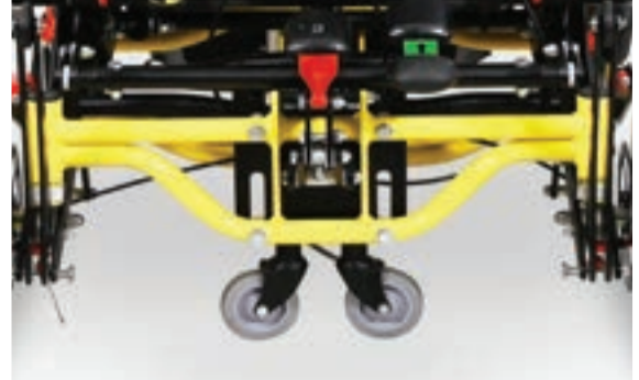
Maneuver laterally in tight spaces with our proprietary Pivot Assist System™.