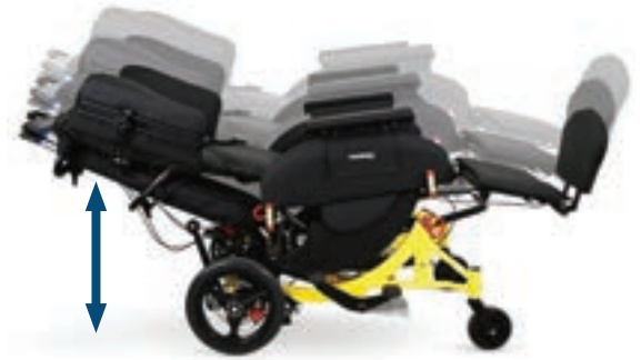
Elevating seat surface height makes transfers easy and safe, raising from 22.5" to 32".