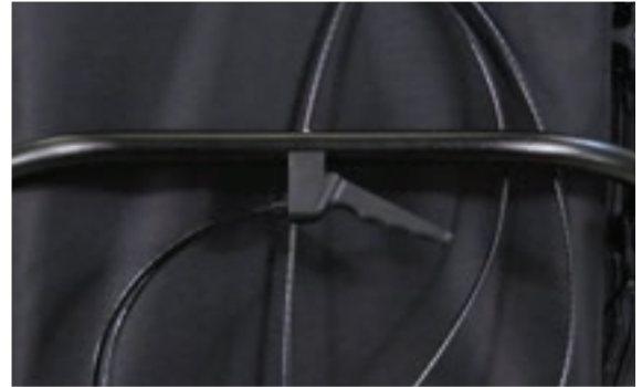
Hand brake for quick and easy stopping on ramps.