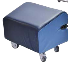
Reflexion™ Foam Removable Legrest