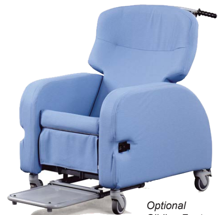
Optional Sliding Footrest

The sculpted back and contoured seat provides good positioning for activities such as eating and drinking, while relaxing and sleeping is encouraged by the comfort of the uniquely linked back and seat recline - as the back reclines, the seat angle increases.